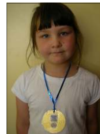
Rippa Rugby Tournament